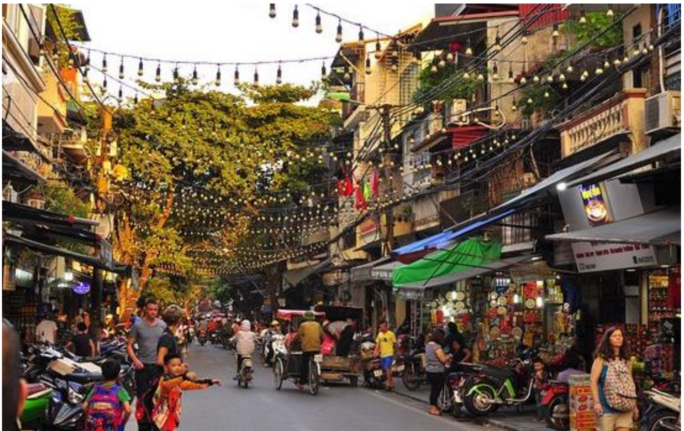
Ha Noi Old Quarter

Afternoon , proceed to Halong through the rich farmlands of the Red River Delta. Upon arrival, check in hotel and free time for relax or go to Casino by yourself.