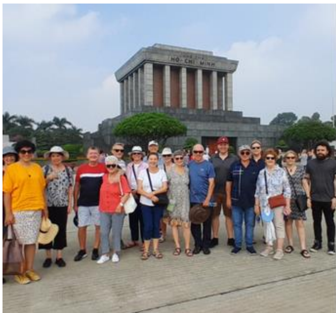
Ho Chi Minh Mausoleum