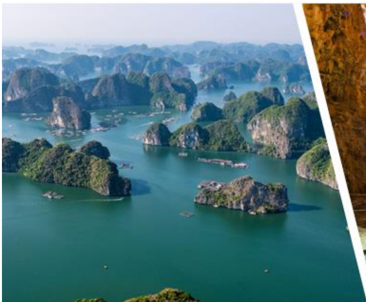
The overview of Ha Long Bay

After breakfast, we start enjoying 3.5 - 04 hours boat trip. We walk into the Thien Cung cave (Heaven Palace cave) to see thousands of stalactites and stalagmites colored by hundreds of neon lights. After 1 hour stay in the “ Heaven Palace ”, we are back to the boat for cruising along the World Nature Heritage part to see the Incense Bowl islet, Cock fighting islets Sail islet, Turtle island .... A delicious seafood lunch will be served when we are completely relax on boat. We are both having seafood and seeing the wonderful sightseeing outside. We finish our boat trip and back to our vehicle for transferring to Hanoi with stopovers at Ceramic and Hand Embroidery Workshop en route. At around 17:00PM we will be back to Hanoi.