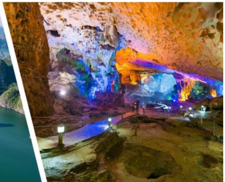
Thien Cung cave