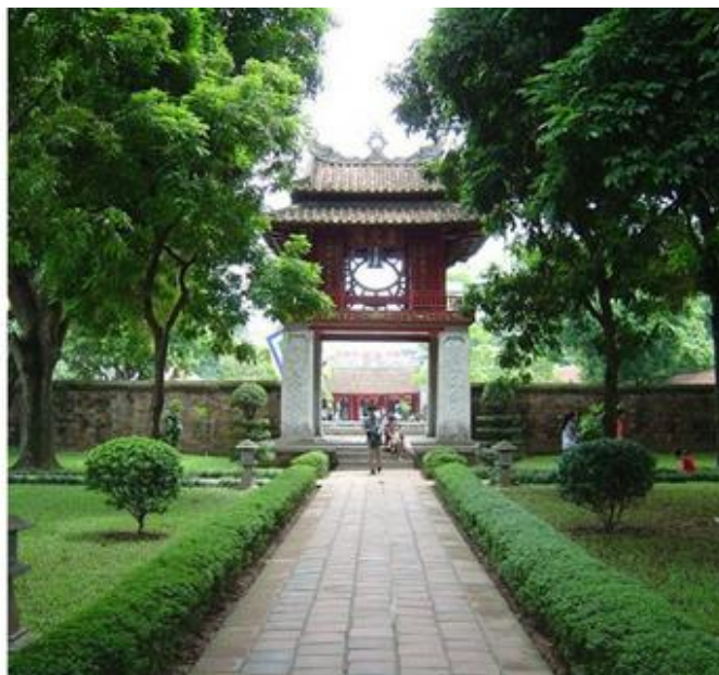
Temple of Literature

Note: Please kindly take note that Ho Chi Minh Mausoleum (the inside) will be opened only in the morning. It will be closed every Monday and Friday and every afternoons. Besides the outside of Ho Chi Minh Mausoleum, you can still visit Ba Dinh square, Presidential Palace, Ho Chi Minh's House on stilt, One pillar pagoda as normal.